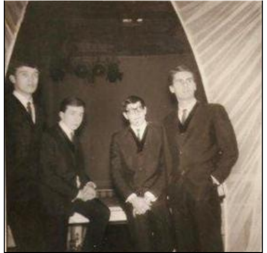
The Hi-Fi's backstage kathy Kirby show 3rd Dec; 1964