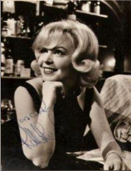
Autographed Kathy Kirby from TV show 1964