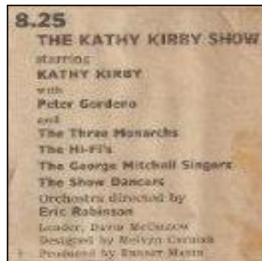
Radio Times listing, broadcast on 11th Dec;1964

a ? mark after the town played at indicates that the venue name is unknown. Due to lost data the 1964 gigs are not complete, this listing is possibly only 50% of actual gigs played. Should anyone have details of others, then please contact us through the website with them.